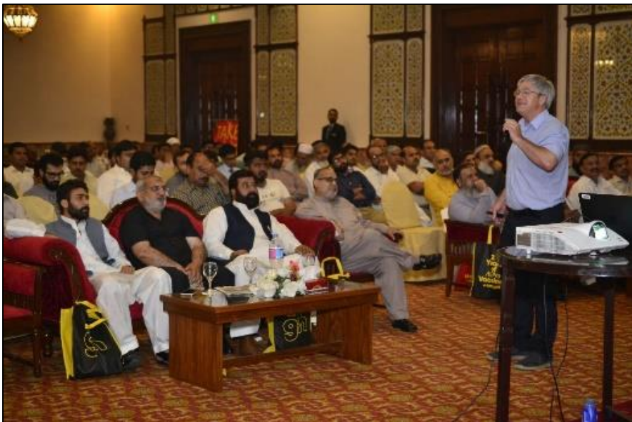
Faisalabad participation was surprisingly high to our sheer delight.